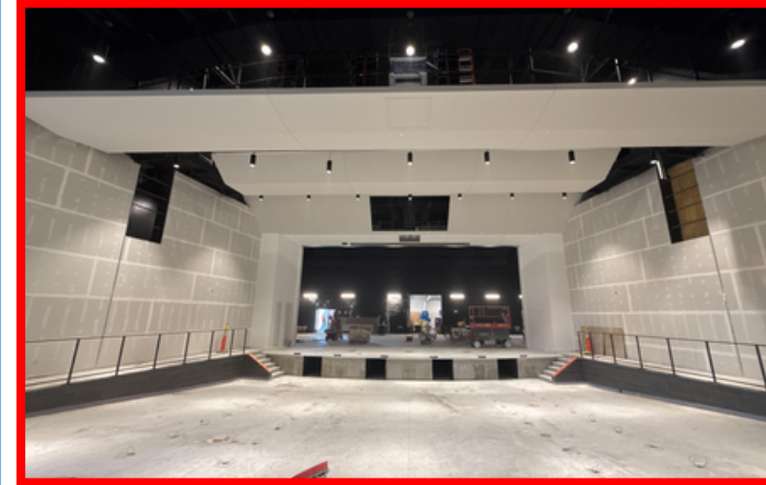
Railings, Stairs, & Tile Installed