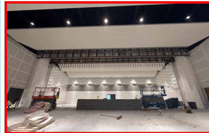
Flex Auditorium / Sound Booth