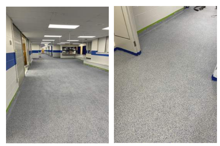
Raytown High School, New Cafeteria Floor Finish