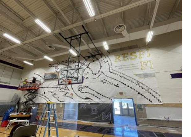
Central MS Gym Mural Paint Underway