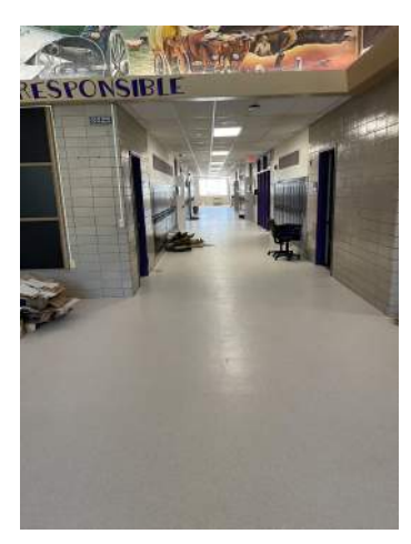
Central MS, New Corridor Floor Finish