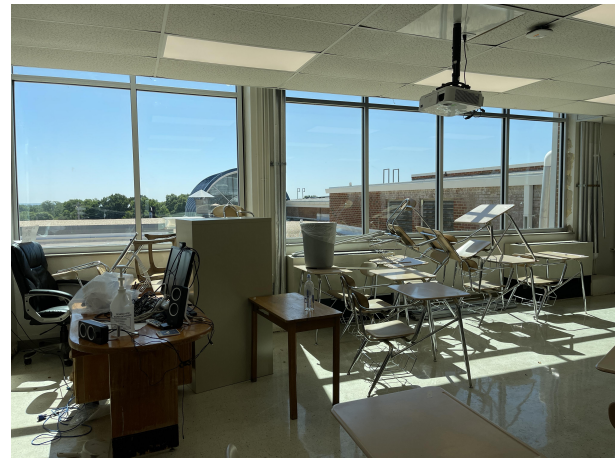
Raytown High School, New Window Installation in Progress