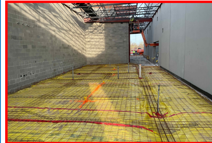
Prior to Pour at Classroom/Dressing/Makeup Area