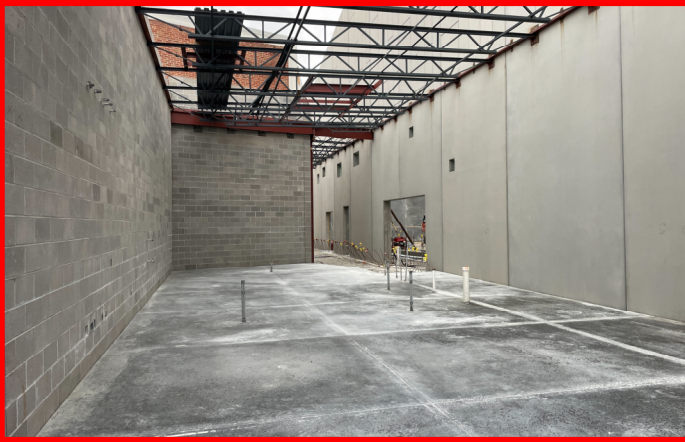
Slab on Grade Poured at Scene Shop