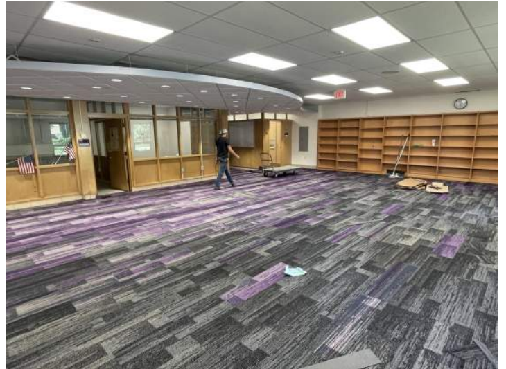
Central Middle School