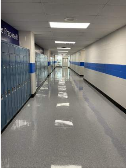
Raytown High School