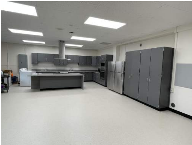
Northwood Life Skills Renovation