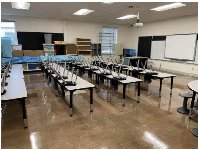
Elementary Furniture Installation